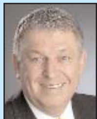
Jerry Colangelo Chair NBA Representative JDMD Investments, LLC