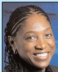
Teresa Edwards Athlete Representative 1984, 1988, 1996, 2000 Olympic gold medalist, 1992 Olympic bronze medalist