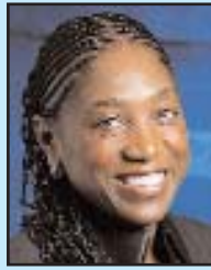
Teresa Edwards Athlete Representative 1984, 1988, 1996, 2000 Olympic Gold Medalist, 1992 Olympic Bronze Medalist