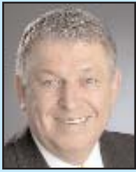
Jerry Colangelo Chairman NBA Representative JDMD Investments, LLC