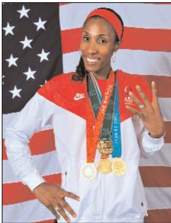
A four-time Olympic gold medalist, Lisa Leslie led the United States to Olympic gold medals in 1996, 2000, 2004 and 2008, and aided the U.S. to FIBA World Championship gold medals in 1998 and 2002.

FIBA holds World Championships at the senior level every four years (2010, 2014, etc.). Unlike the Olympics when 12 teams participate, 24 countries compete in the World Championship for Men and 16 teams participate in the World Championship for Women. The World Championship title is considered as prestigious as the Olympic title. The USA men compiled an 8-1 record to capture the bronze medal at the 2006 World Championship in Japan, and the USA women also claimed bronze in 2006 with an 8-1 record in Brazil. The next FIBA World Championships are scheduled for Aug. 28-Sept. 12, 2010, in Turkey for the men and Sept. 23-Oct. 3 in the Czech Republic for the women.