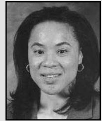
Dawn Staley Athlete Rep. Player, WNBA Houston Comets / Head Coach, Temple University